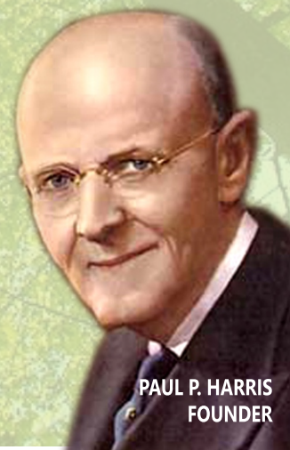
PAUL P. HARRIS FOUNDER